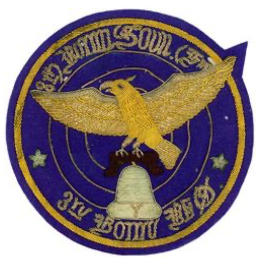
8 Bombardment Squadron, Light, Night Intruder